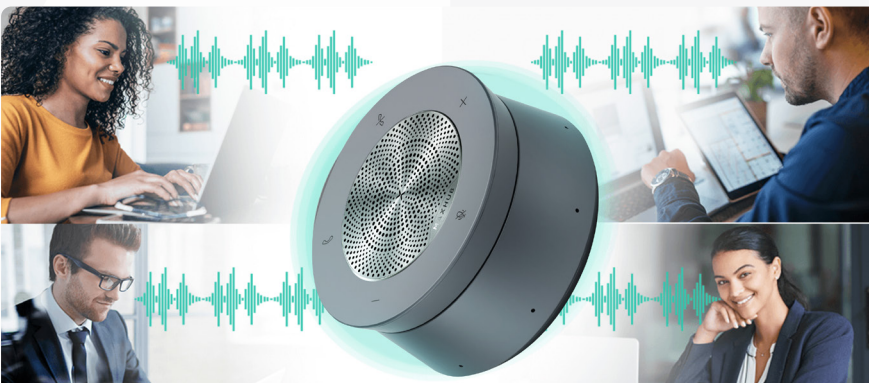
> Allows multiple users to communicate simultaneously